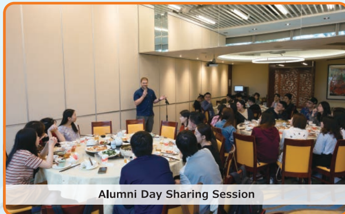
Alumni Day Sharing Session