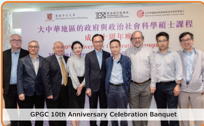
GPGC 10th Anniversary Celebration Banquet