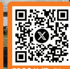
GPGC X (Twitter)