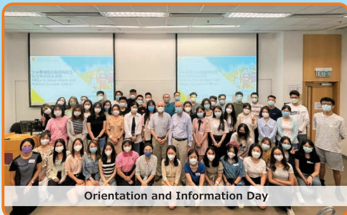
Orientation and Information Day